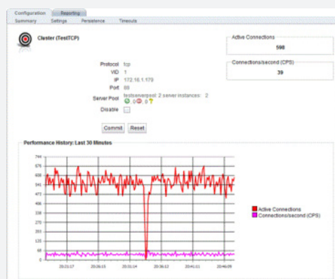
Sample of a TCP Cluster Configuration Summary Screen